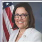
DISTRICT 1 Rep. Suzon DelBene