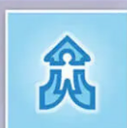
LEVY Kent School District Capital Projects and Technology Levy