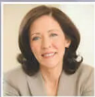
SENATE Maria Cantwell