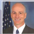
DISTRICT 9 Rep. Adam Smith