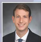
DISTRICT 34 Rep. Joe Fitzgibbon