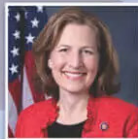
DISTRICT 8 Rep. Kim Schrier