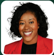
NAR CEO NYKIA WRIGHT

FEATURING EXCLUSIVE GUEST SPEAKERS FROM THE NATIONAL ASSOCIATION OF REALTORS®